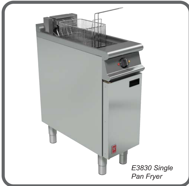
E3830 Single Pan Fryer