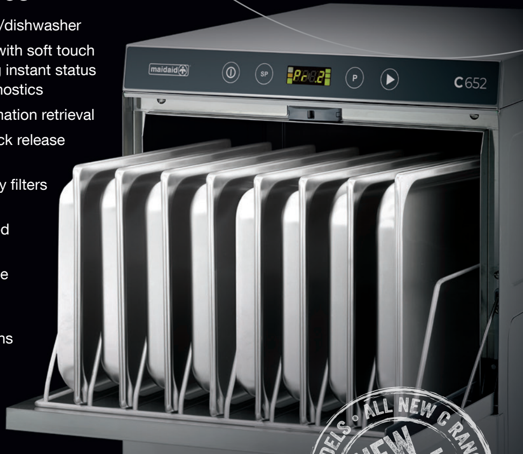
C652: Shown with tray insert – not included