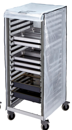
GBCTUGNPR21 Optional Heavy Duty Vinyl Cover for GN 2/1 Full Size Trolley.