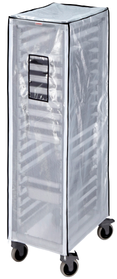
GBCTUGNPR11 Optional Heavy Duty Vinyl Cover for GN 1/1 Full Size Trolley.

All Trolleys ship knockdown (KD) complete in 1 box with casters and bottom frame wedges factory assembled on posts.