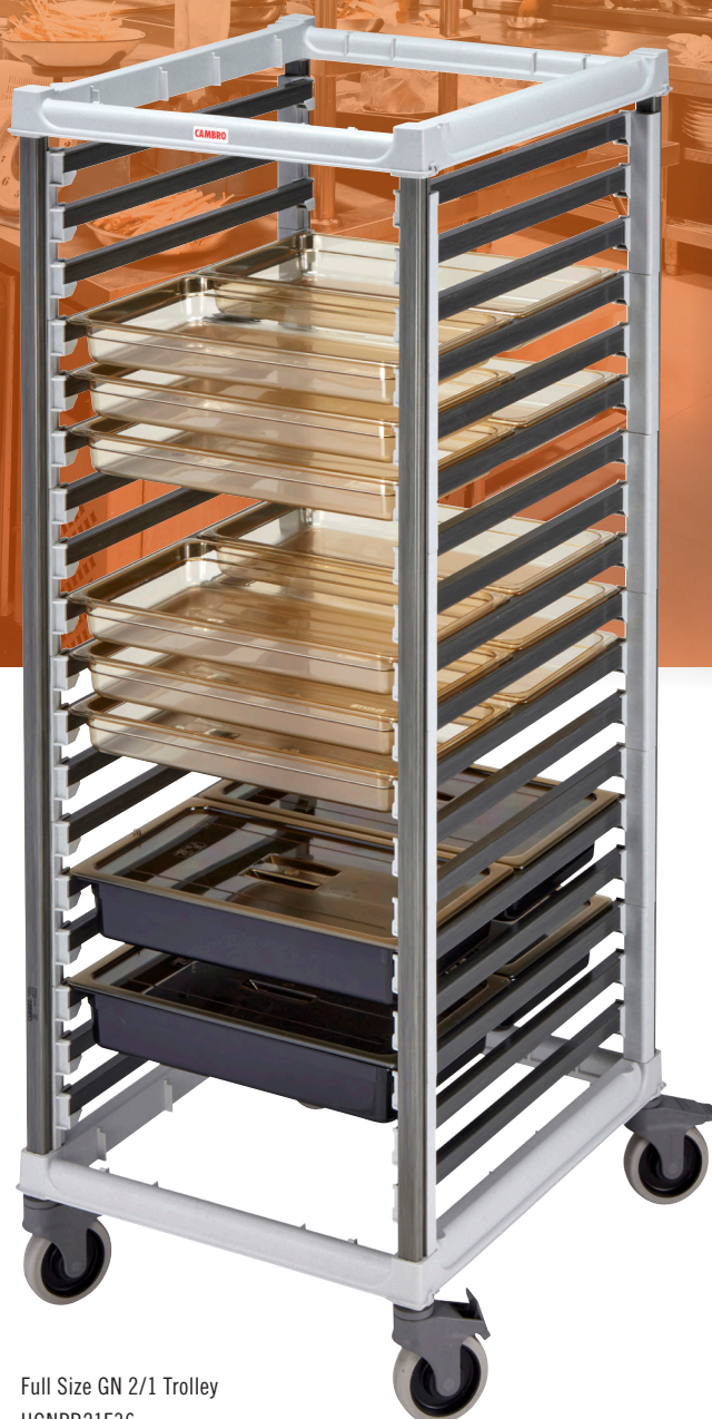
Full Size GN 2/1 Trolley UGNPR21F36