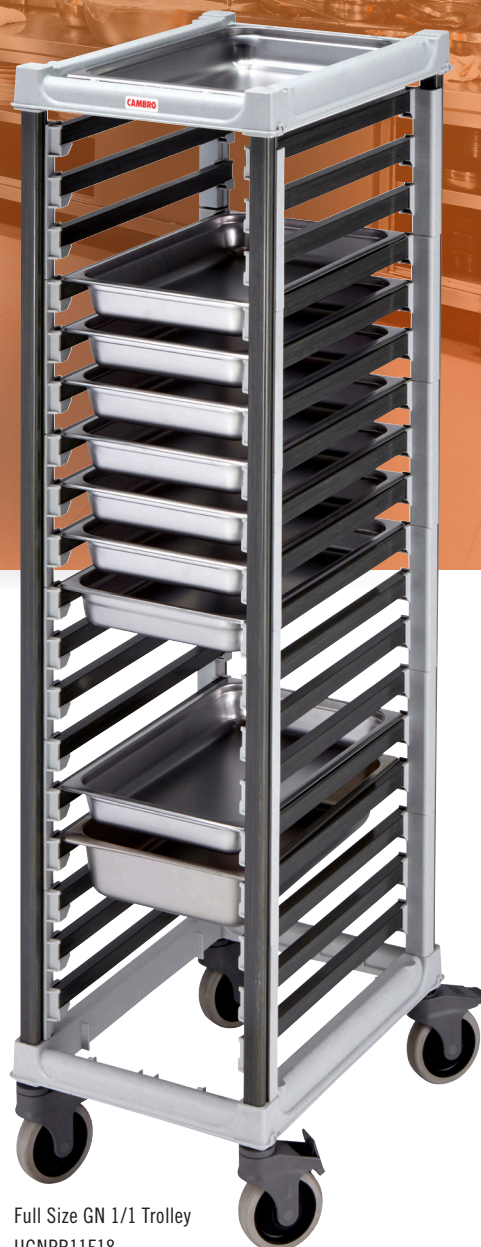
Full Size GN 1/1 Trolley UGNPR11F18

Lifetime Warranty Against Rust and Corrosion